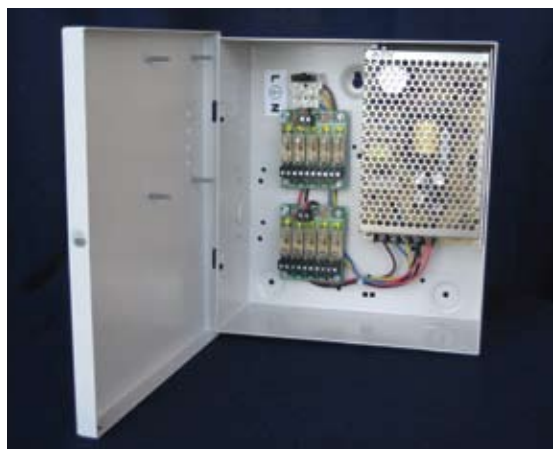
Pictured above the interior of the new SMM unit

The new SMM range. Power-Plex recently introduced a new Switch Mode DC range of power supplies which range from 3 Amps up to 16 Amps and can be supplied with multiple fused outputs ( 5, 10, 15 or 20 fused outputs, LED indicating and with either traditional glass fuses or the new PTC re-settable 'smart' fuses). Being very competitively priced, they have proved very popular with many international customers, particularly for CCTV applications.