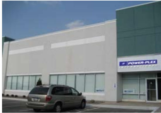
Pictured above the exterior of the new premises.

The new address is 2885, Argentia Road, Unit 4, Mississauga, Ontario L5N 8G6. The phone, fax and email stay the same.