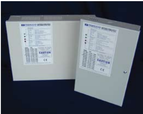
Typical indoor housing

...an intelligent microprocessor controlled power supply for professional installers.