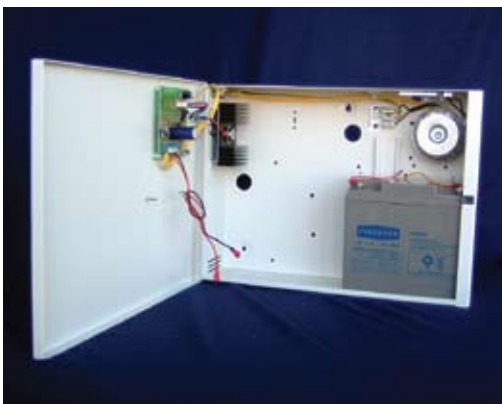
Large Box (interior)